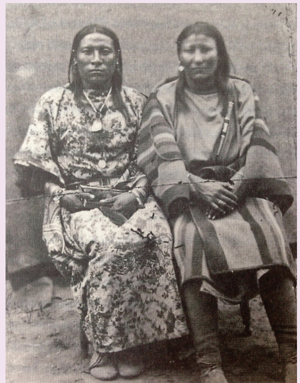
Osh-Tish (Finds Them And Kills Them), Crow tribe, was a Badé. On the left is Osh Tish, a biological male in woman's attire, his wife to the right. Osh Tish earned a reputation for bravery and was afforded distinctive social and ceremonial status within the tribe.