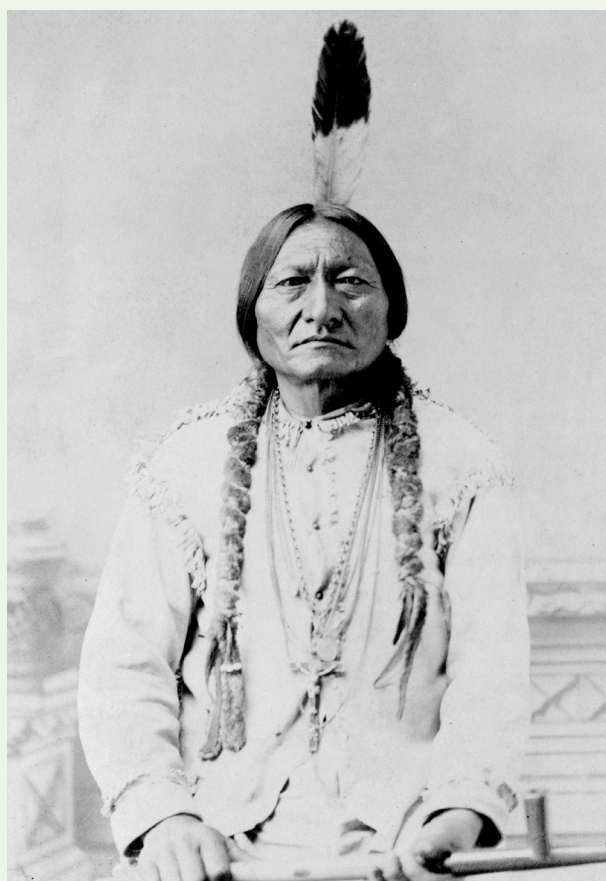
Chief Sitting Bull